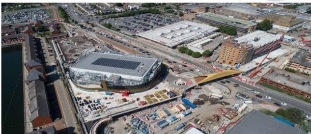
Arena - from the East

Innovation Precinct: Change Request with incorporated comments re-submitted. Business Process consultant appointed,